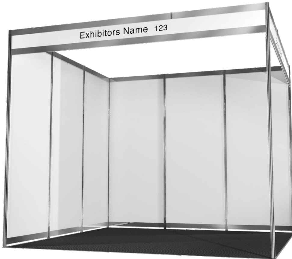
Example image is based on a 3m x 3m stand open on two sides